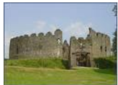
Restormel Castle – Lostwithiel

Fowey (18 miles) - Fowey (pronounced Foy) is situated on one side of the Fowey River estuary with Polruan on the other (which can be reached by passenger ferry). During high tides boat trips run from the town quay. Yachts and Dinghies crowd the estuary in the summer and from the docks, which lie upriver, China Clay is exported. There are two local festivals, the first is an arts and literature festival celebrating the life of it's most famous resident Daphne Du Maurier, which runs during May www.dumaurier.org and the second is Fowey Regatta Week which is the village carnival week and takes place at the end of August – www.foweyregatta.co.uk Upon arrival it is recommended that you park in the main car park as it can get very congested in the town, although this does mean an uphill walk when you return to your car!