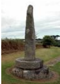
The Tristan Stone

The Hurlers, Minions - one of Cornwall's most important prehistoric sites, the Hurlers is a series of stone circles standing high on Bodmin Moor.