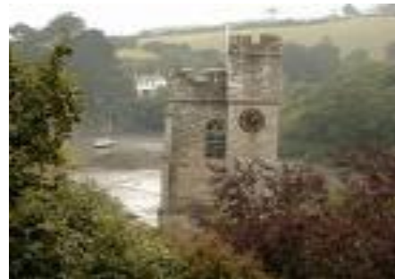
St Just in Roseland

St Mawes (14 Miles) - St Mawes is situated at the southern end of the Roseland Peninsula. An important port in medieval times, and now a characterful and chic coastal village and yacht haven, it is protected by the most perfectly preserved of Henry VIII's coastal fortresses. St. Mawes Castle was built in the 16th century to counter the invasion threat from Europe in partnership with its twin, Pendennis, on the other side of the Fal Estuary. There is a regular pedestrian ferry service to and from Falmouth, as well as a small seasonal passenger ferry with a regular service throughout the day between St Mawes and Place, offering an opportunity to explore the beautiful St Anthony Head and enjoy circular walks in the area.